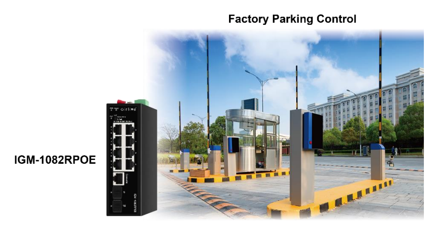
Built-in SFP for long distance transition

Extend the network further with the 1.25G SFP slots. The SFP ports also supports DDM which offers more information about the fiber connection and makes it easier to find any faults or bad connections.